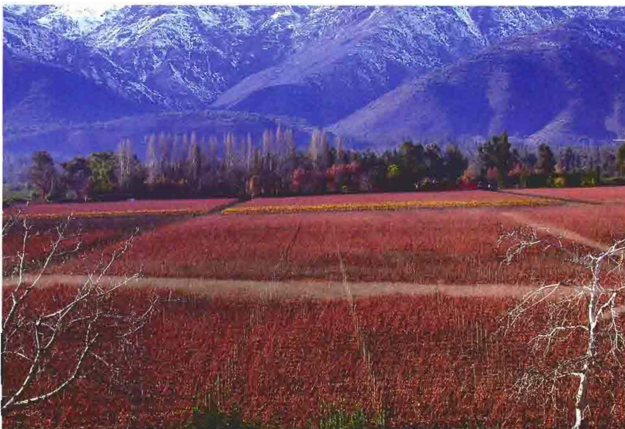
Maipo vineyard in winter